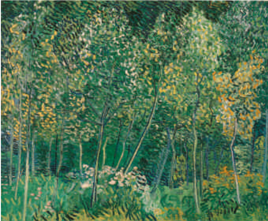
13. Vincent van Gogh, Trees , 1890, oil on canvas, 73 × 92 cm. Private collection; F 817 JH 1319