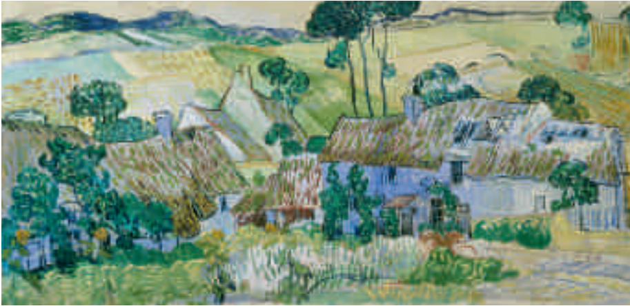
12. Vincent van Gogh, Farms near Auvers , 1890, oil on canvas, 50.2 × 100.3 cm. The National Gallery, London, on loan from Tate; F 793 JH 2114

mention of that in the letter to Theo in which he described his drawing. 29 He merely compared it to his ambitious study of the woman he was living with, the pregnant former prostitute Sien Hoornik (ill. 11). He had portrayed her as a woman scarred by life, and saw similarities to the age-old trees ravaged by nature in his drawing. 'Frantically and fervently rooting itself, as it were, in the earth, and yet being half torn up by the storm. I wanted to express something of life's struggle, both in that white, slender female figure and in those gnarled black roots with their knots. Or rather, because I tried without any philosophizing to be true to nature, which I had before me, something of that great struggle has come into both of them almost inadvertently' [222].