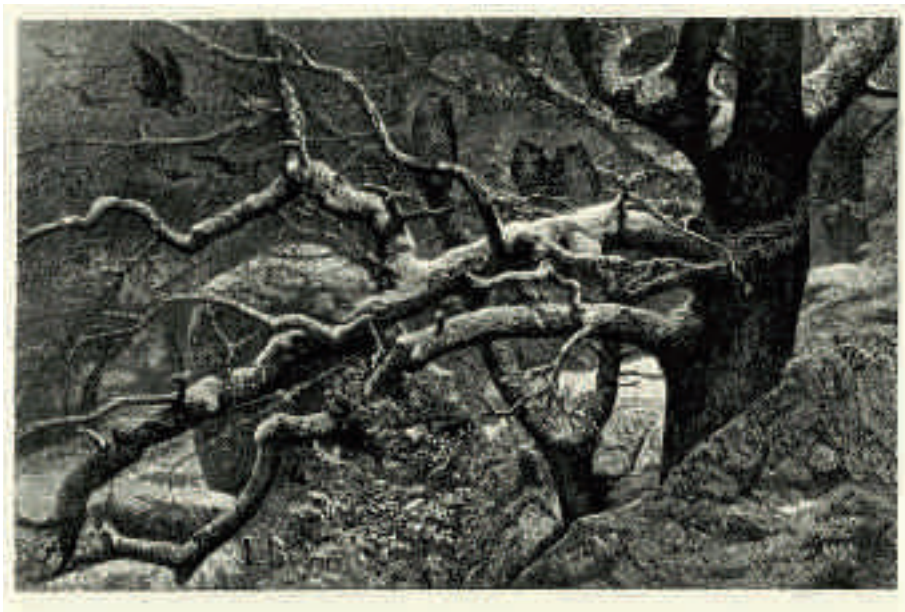
10. Karl Bodmer, Assembly of eagle owls , 'Série de vingt eau-fortes, no. 14'. Bibliothèque Nationale de France, Cabinet des Estampes, Paris