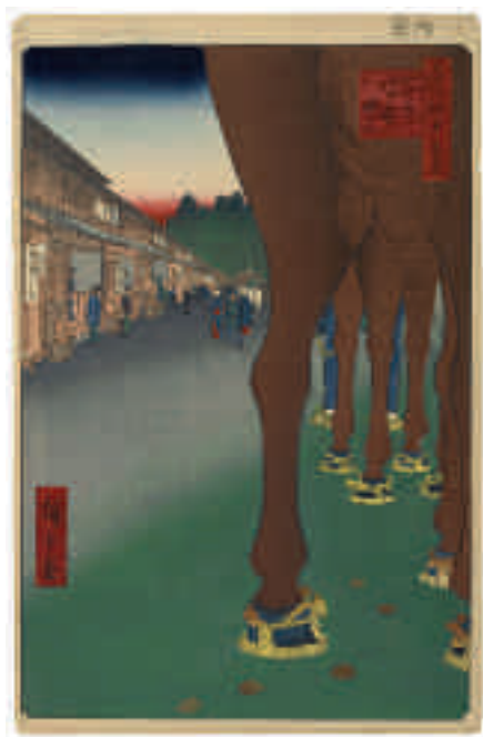
2. Ando Hiroshige, The new station of Naito, Yotsuya , no. 86 from One hundred famous views of Edo , 1857, woodblock print, 36 × 23.5 cm. Brooklyn Museum. Gift of Anna Ferris