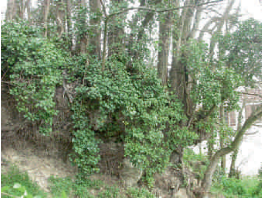
7. Elms and chalk face near Rue Gachet, Auvers-sur-Oise. Face of the old pit with abandoned elm coppices on the edge overgrown with ivy; April 2005

area was probably quite flat. However, it is doubtful whether the reddish brown area at bottom right was also a level surface. It looks rather perfunctory and was probably not observed from life but filled in to match the rest of the scene.