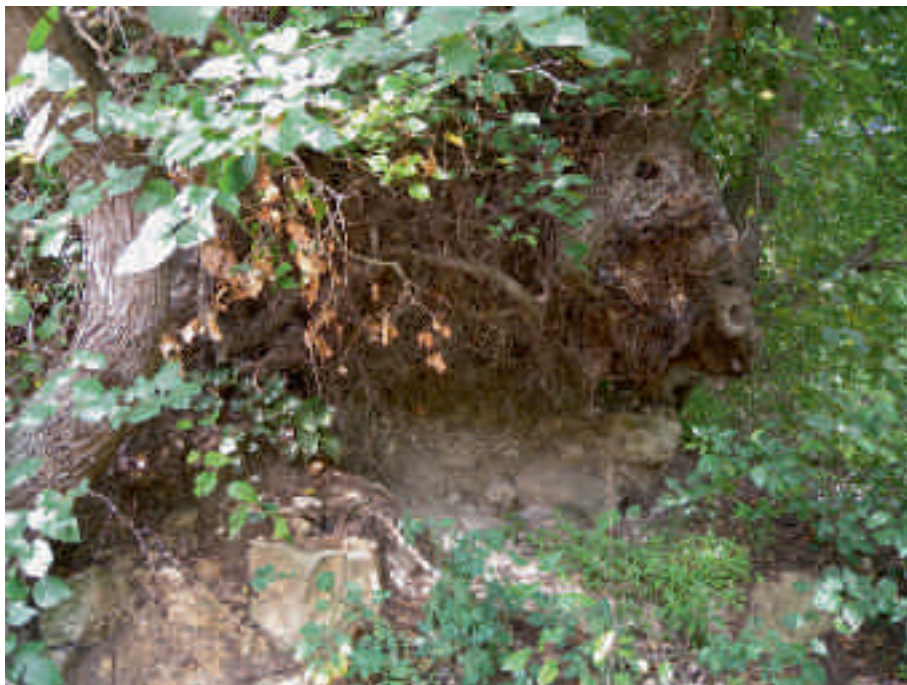
6. Elms near Rue Gachet, Auvers-sur-Oise. Detail of roots and the stools of coppiced elms with the scars and scar tissue of felled trunks; August 2011

Limestone mining was a traditional activity in the area, so excavating a hillside on which there was a copse or a brushwood hedge would have created the chalky face. Once the quarry had been abandoned the slope would have taken on an irregular shape through the action of water, wind and the working of the tree roots on its edge, and that helps explain the shadows cast by the trunks in the centre, which are difficult to read. 22 What is striking is that the group to the right of the two on the left is on a slight slant. Trees grow vertically, so the fact that the roots of one stump are completely exposed suggests that this is a group of small trees that has slipped down and is only attached to the face of the slope by a few roots. Because the passage to the right of it seems to be an extension of this sagging group, we can cautiously assume that we are seeing a section of the unstable, subsiding margin of a wood.