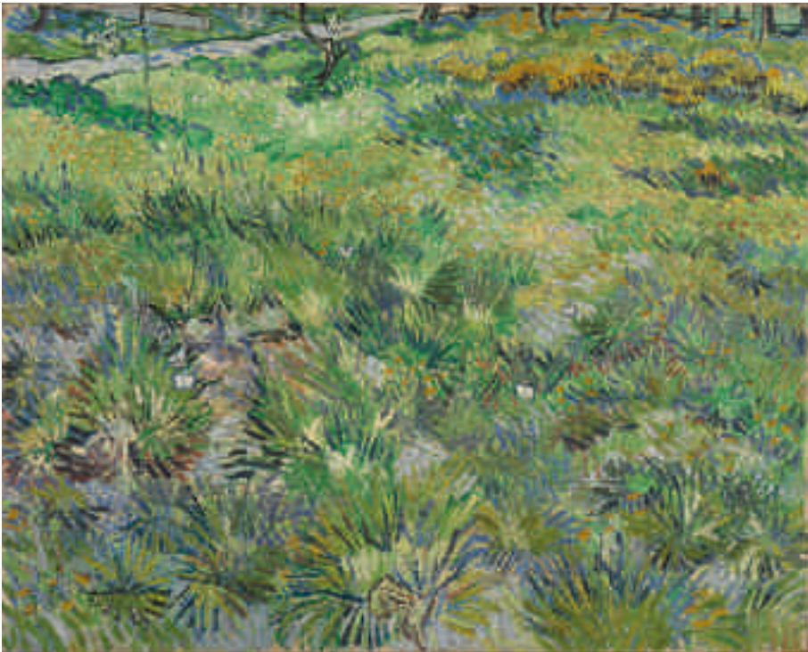
..... 4. Vincent van Gogh, Long grass with butterflies , 1890, oil on canvas, 64.5 × 80.7 cm. The National Gallery, London; F 672 JH 1975