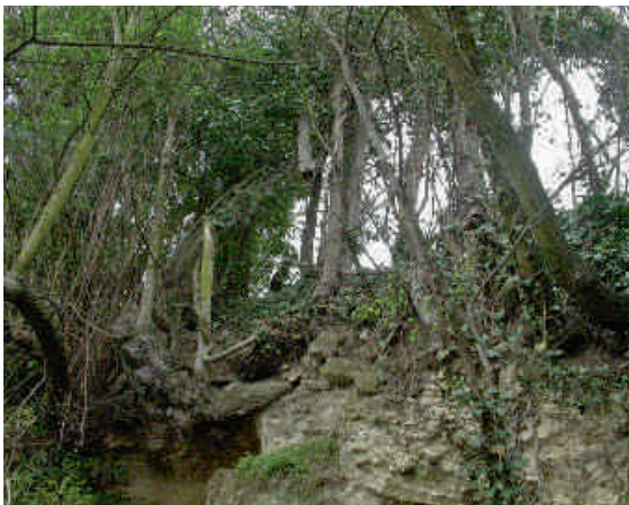
5. An old pit near Rue Gachet, Auvers-sur-Oise. The top of a chalk face with the roots and gnarled stools of abandoned elm coppices and all kinds of plants in the undergrowth; April 2005

In 1928 De la Faille described the earth as 'pinkish yellow' and the tree trunks as 'violet-blue and blue-grey', not blue as they are now. 8 The suspicion is that Van Gogh used the unstable pigment geranium lake, which tends to vanish like snow in sunlight. 9 As a result the earth gradually became yellower with the passage of time, and the patches of light are now less noticeable. 10 Of course we do not know how strong the pink and the violet were originally, but the yellow and yellowish white would certainly have stood out more than they do today.