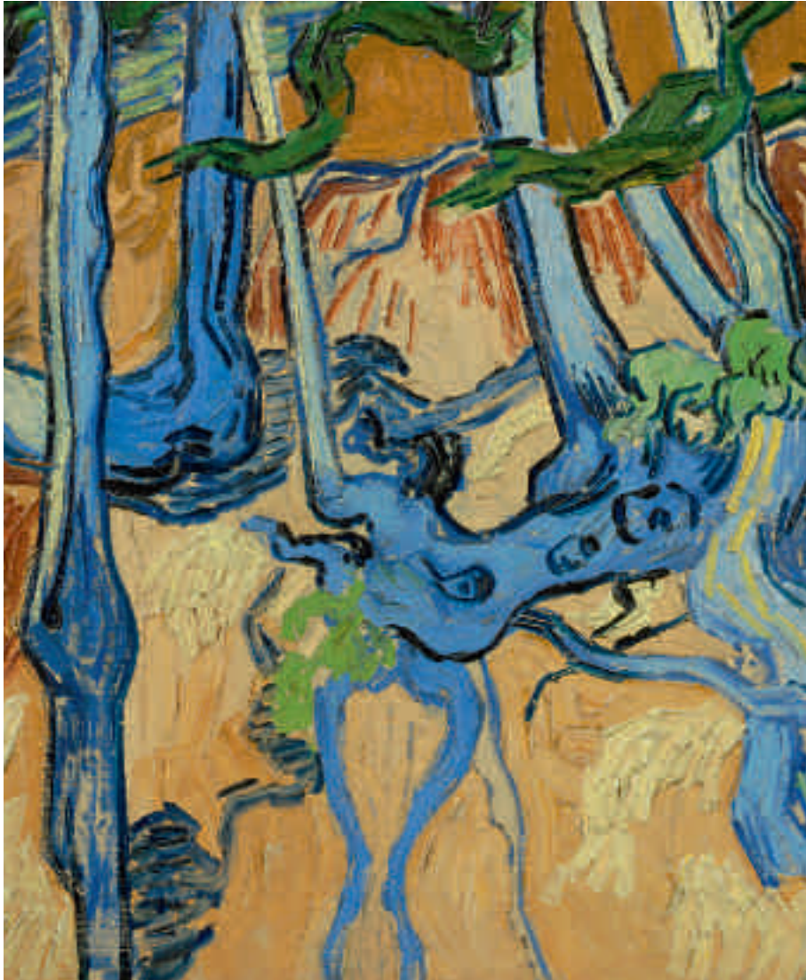
..... 1. Detail of ill. 3